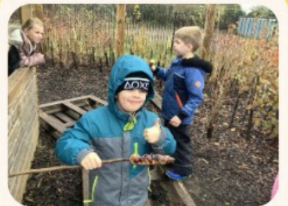
Eating bread with toppings!