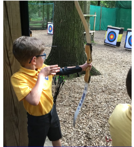
Archery at High Lodge

We are very much looking forward to a wonderful year ahead.