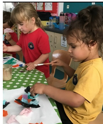
Collage in Reception