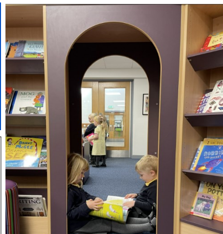
Enjoying library time