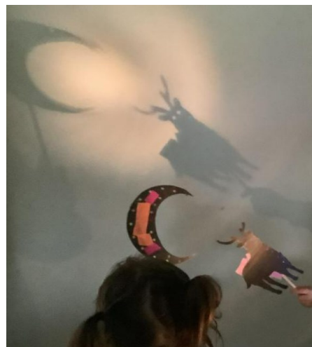
Reception exploring shadows

The week ended with our fabulous choir singing at the garden centre. With Christmas clothing and accessories they have brought Drake into the season of Christmas—and we can't wait for what's next!