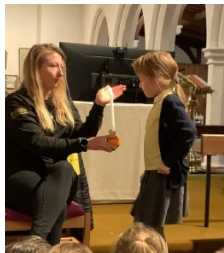
Year 3 Church Visit