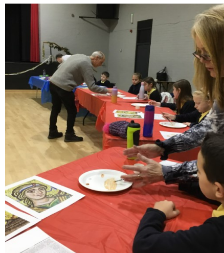
Guildhall Mosaic Project— Working with an artist