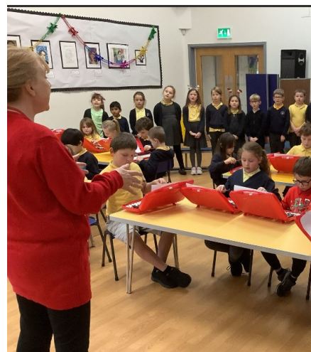
Year 3 singing and playing the Glockenspiels