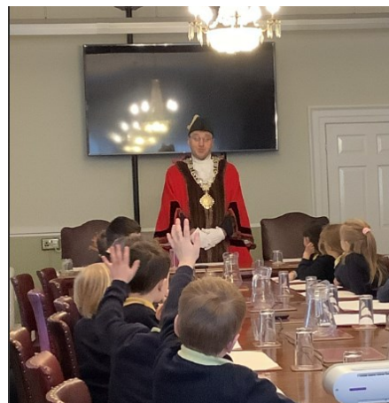
Year 2 at King's House