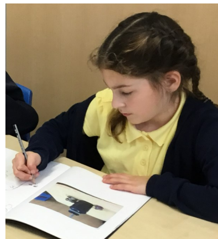
Year 4 Art— sketching