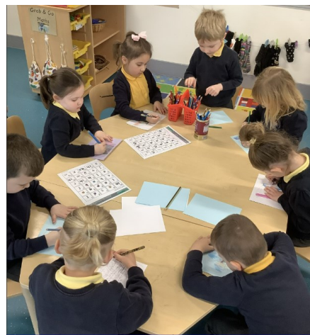
Reception Drawing Club

On Tuesday and Wednesday this week we welcomed 'West End in Schools' in to provide Year 2 - Year 6 with a workshop. This workshop helped kick off the excitement for 'World Book Day' next week. In the workshops, children explored either 'Where the Wild things are' or 'The butterfly lion', reading the story and then using creativity, imagination and teamwork to explore the chosen story through movement and dance. Each class then put together a short choreography to present to their class teacher.